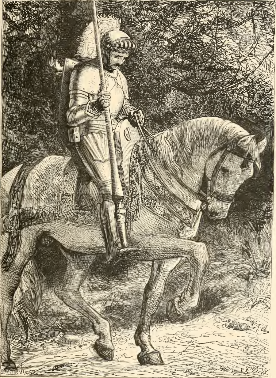
SIR ROLAND OF TRIERMAIN. — Page 384.